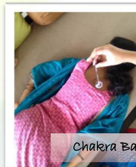
Chakra Balancing with pendulum