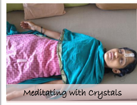
Meditating with Crystals